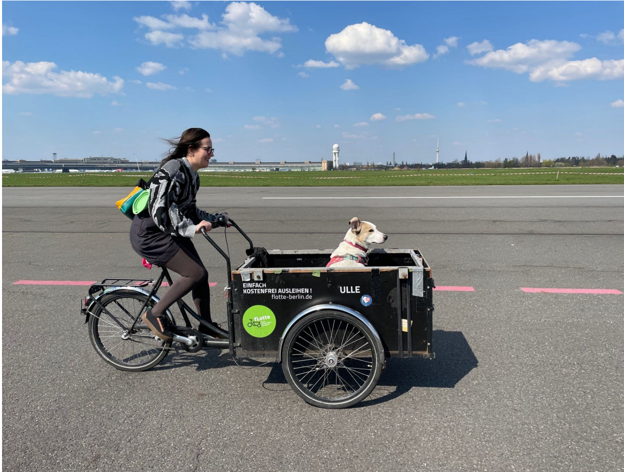
fLotte cargo bikes in action